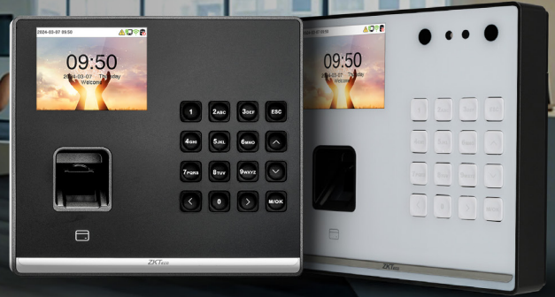
GTC2 & GTC2F-H